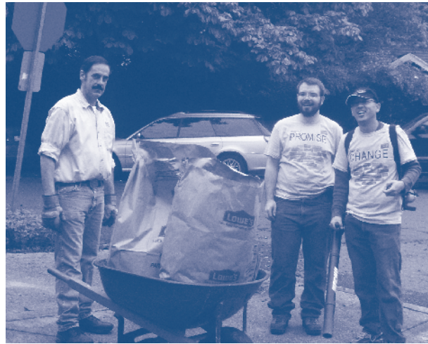
Volunteers from Perkins Coie, Microsoft and Wright Runstad & Company spent a day helping during United Way of King County's Day of Caring at Boyer.

We can always use a hand in our administrative offices. Volunteers help us send out fundraising and informational mailings, organize files and supplies, answer phones and assist with many other necessary tasks.